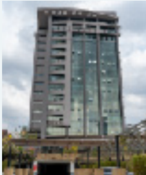
One Padmore Place